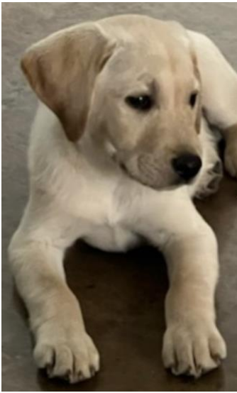
Introducing Ari the Labrador and Clio the miniature Schnauzer